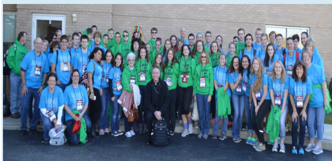
Diocese of Altoona-Johnstown group from 2015