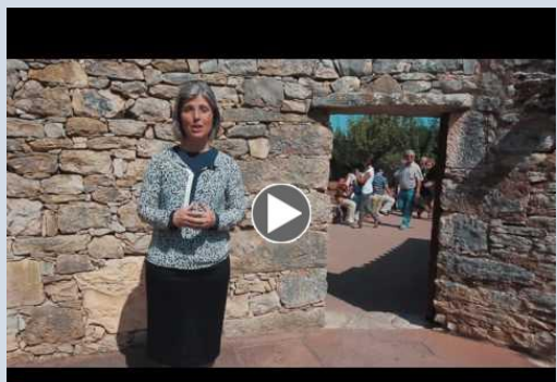
Francisco and Jacinta's House 1:30