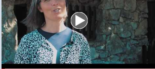
Lucia's House 1:35