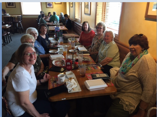
Several of the wives of our Diaconate Community enjoyed a recent get-together at Marzoni's Resturant in Duncansville

Great injustice is done to God's grace whenever we say that sins are punished by his judgment, without first saying - as the Gospel teaches - that the one confessing his sins must have a heart that