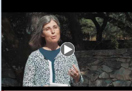
1st Apparition of Our Lady 2:35

Celebrating 100 Years of Fatima Visit ETWN for more videos