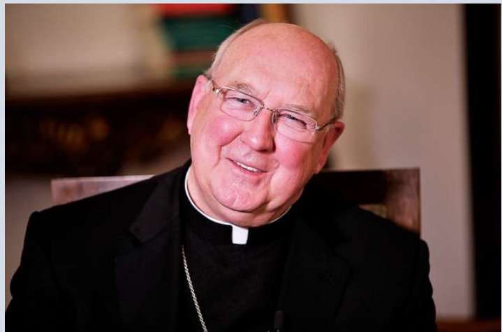
Cardinal Kevin Joseph Farrell Prefect of Laity, Family and Life

Rome, Italy, May 6, 2017 - The Vatican's point-man on family and life issues says rather than just complaining about problems we see in society, we need to focus on the Church's rich, beautiful take on marriage and the family.